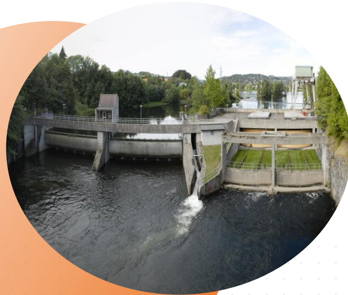
Imaged: Telemarkskanalen, Skiensvassdraget

generates sufficient electricity to supply approximately 3,800 households. The water used by the plant is sourced from the Hjartdalsvassdraget, Sundsbarm, and Tokke-Vinje, with a drainage area covering 10,300 km 2 , the same as the Skotfoss Power Plant. The dam is a sluice dam regulated by two flap gates and has a total storage capacity of 4,242 million m 3 , with an annual average inflow of 1,541 million m 3 .