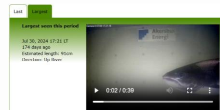
Imaged: Migration, Riverwatcherd Daily

Klosterfoss Hydroelectric Plant is located at the lower end of the Skiensvassdraget watercourse,